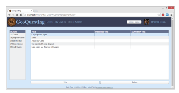
Figure 2. Web game editor interface - Public game list

After successful login the user is present with the main of the web application. The user is able to view the list of already existing games in the system alongside with information about them (Figure 2).