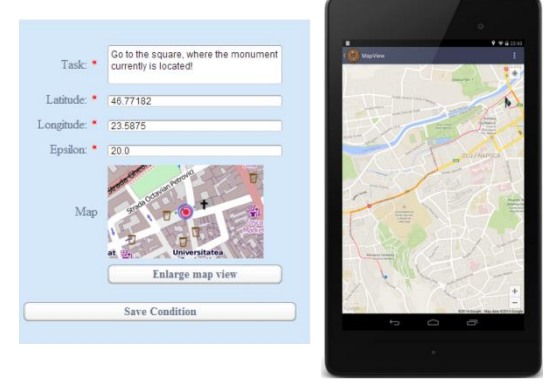
Figure 4. GPS condition

When creating a question-answer condition (Figure 3) the user specifies the question (e.g. "What is the name of the main square of Cluj-Napoca?") and the list of possible answers to the question. The answers for the question can be varied e.g. the Hungarian or Romanian name of the city Cluj-Napoca. In addition to multiple correct answers provided by the editor the mobile client will employ fuzzy text matching based on the Jaro-Winkler distance in order to compensate for some spelling or typo mistakes.